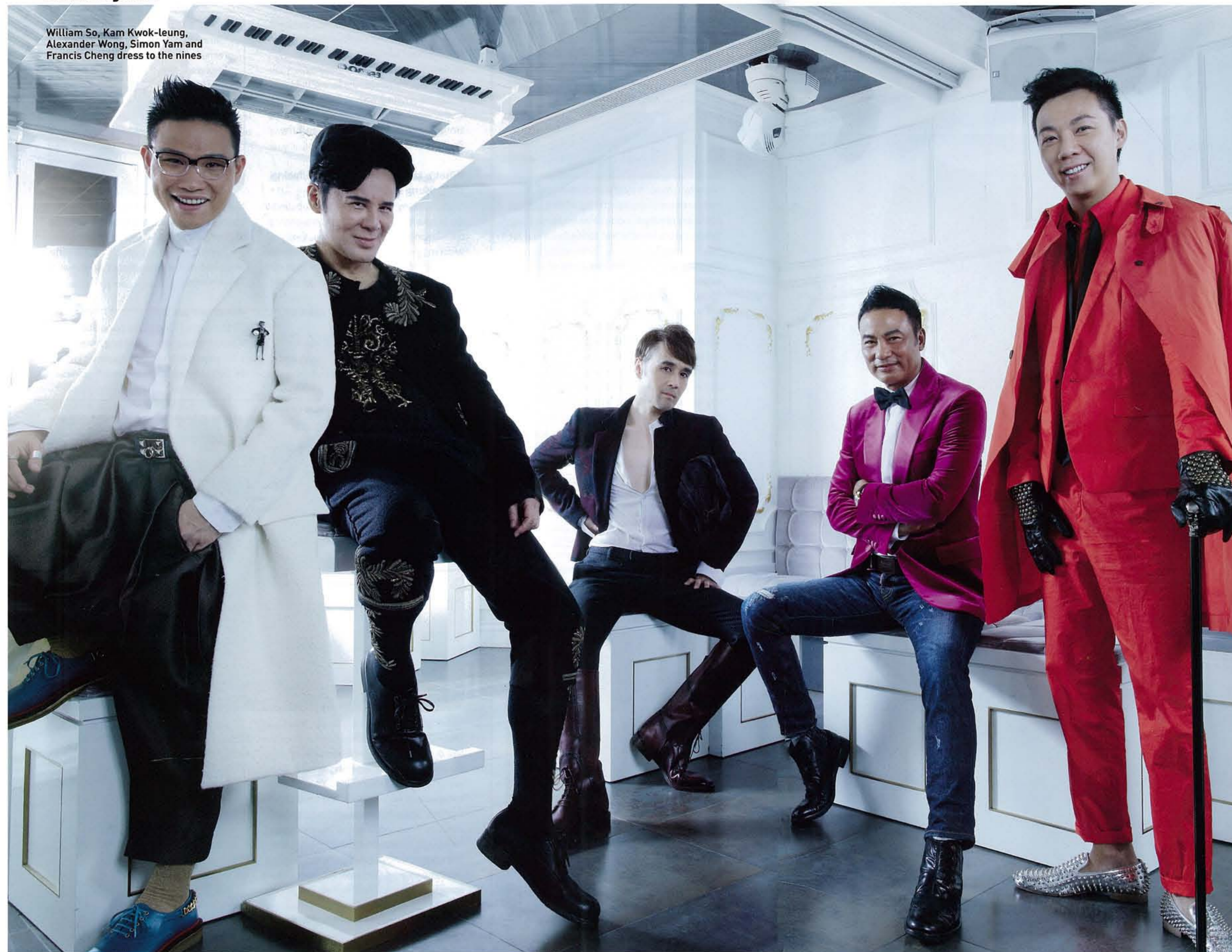
William So, Kam Kwok-leung, Alexander Wong, Simon Yam and Francis Cheng dress to the nines