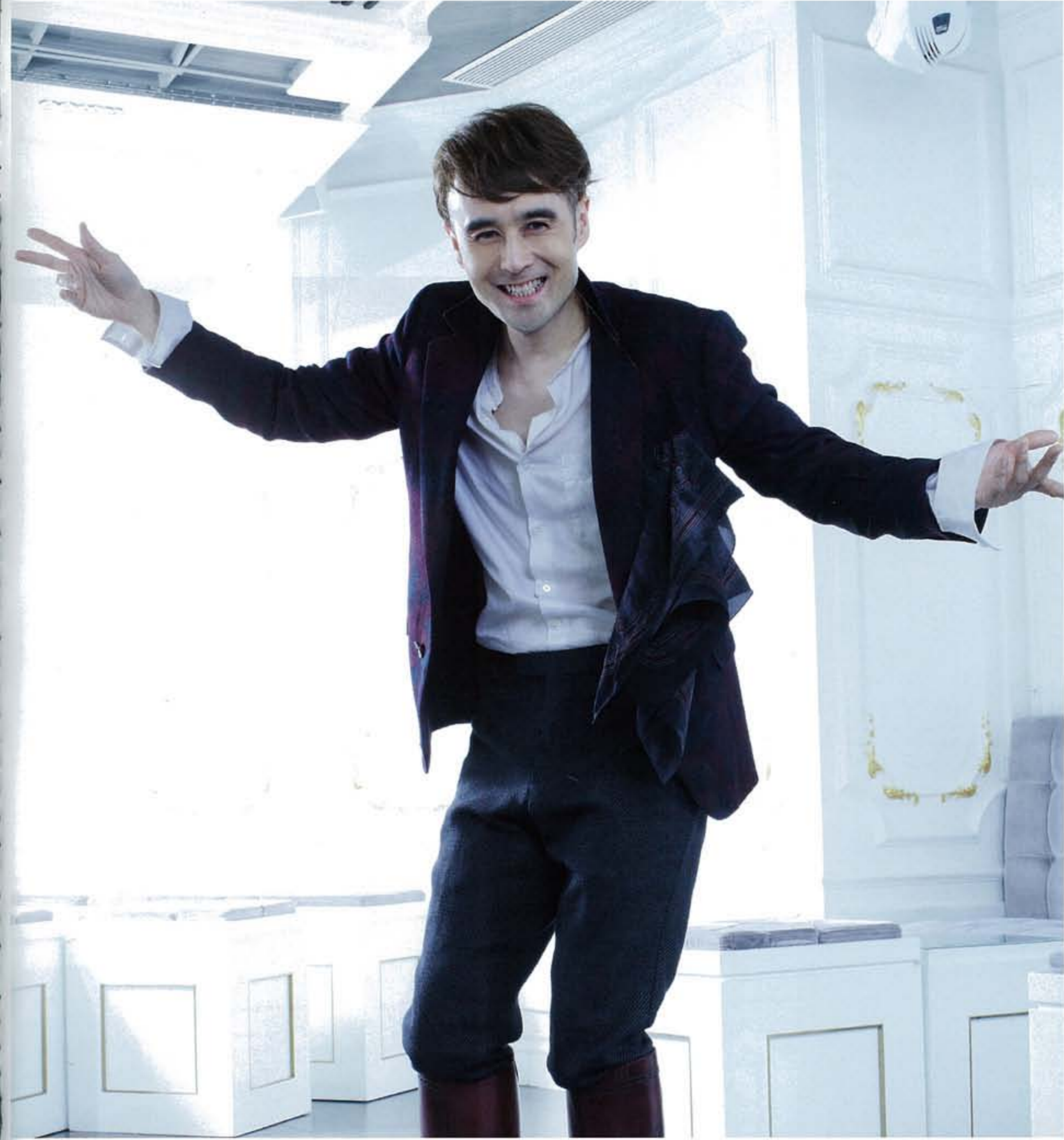
CLOTHES GUCCI / HAIR FASHION ZEN YIP OF SALON VIF