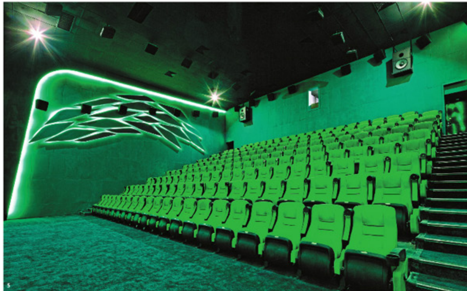
5 The Green Amazon screening room.