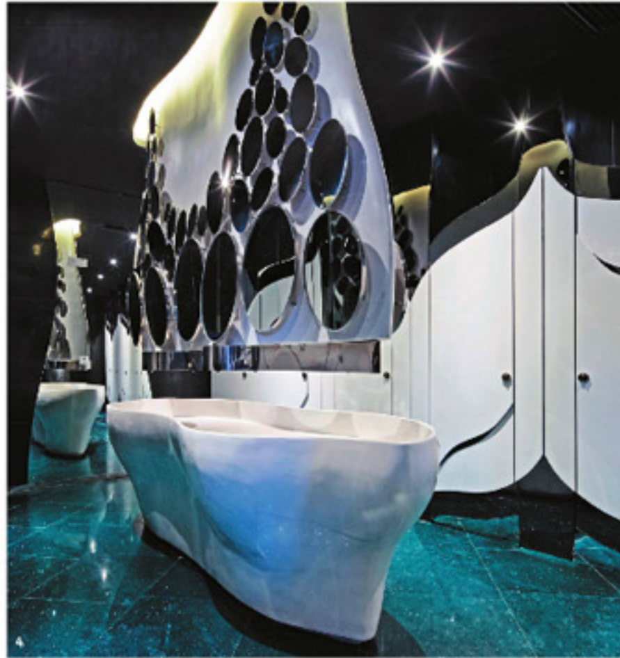
4 The bathrooms reveal bubble mirrors and curved doors.

The individual screening rooms all follow different colour trends and are named respectively. 'Blue Whale' maintains a deep indigo effect and the seating, carpet and walls are coloured in unison. 'Red Earth' appeals to a more fiery character, where the red borders